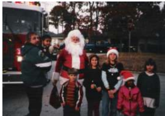
Do you recognize these neighborhood children? This was taken here in Cobblestone many years ago. Santa arrived courtesy of Fire Station 29.